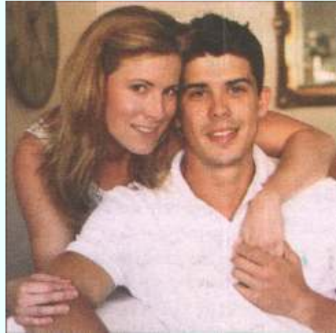
Modern dating: This Sutherland couple met through Fit2Date.

The couple, who now live together at Suth-