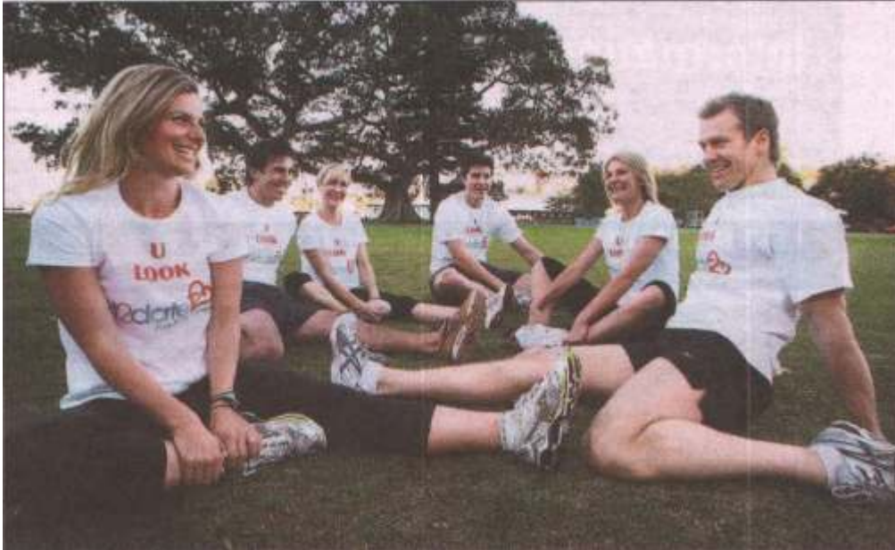
Meet market: A group of 16 singles meet each week for outdoor exercise sessions